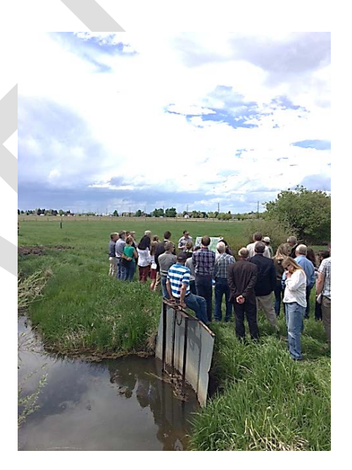
WPIC members discuss Gallatin Valley water issues during a 2018 field trip. (LEPO)