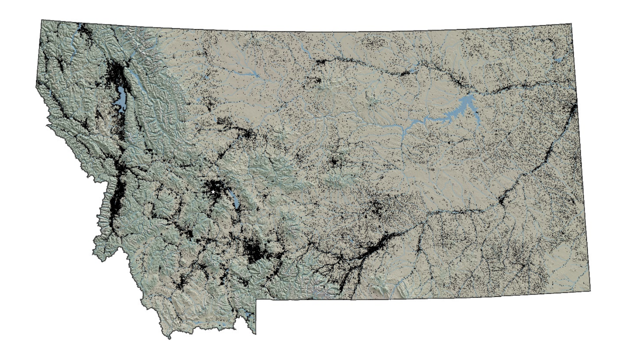
FIGURE 1: DISTRIBUTION OF GROUNDWATER WELLS IN MONTANA<sup>24</sup>

Finally, the agency noticed and adopted administrative rules effectively reinstating the 1989 language. Further discussion of WPIC efforts related to this action and others follow in this report.