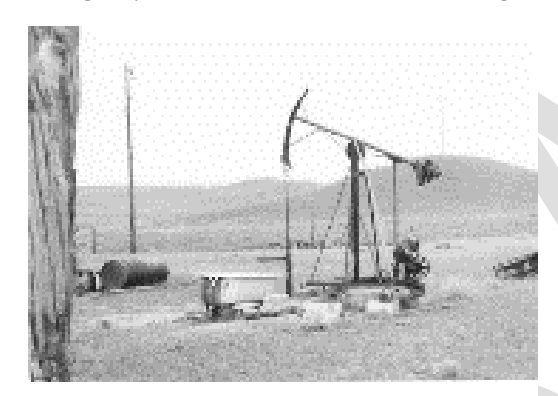
Small water well near Winnett, 1966. (Lewistown Public Library)

The 1972 Constitution effectively modernized Montana's water right process, again recognizing and confirming "all existing rights to the use of any water for any useful or beneficial purpose" and by providing for agency administration, control, and regulation of water rights. 10