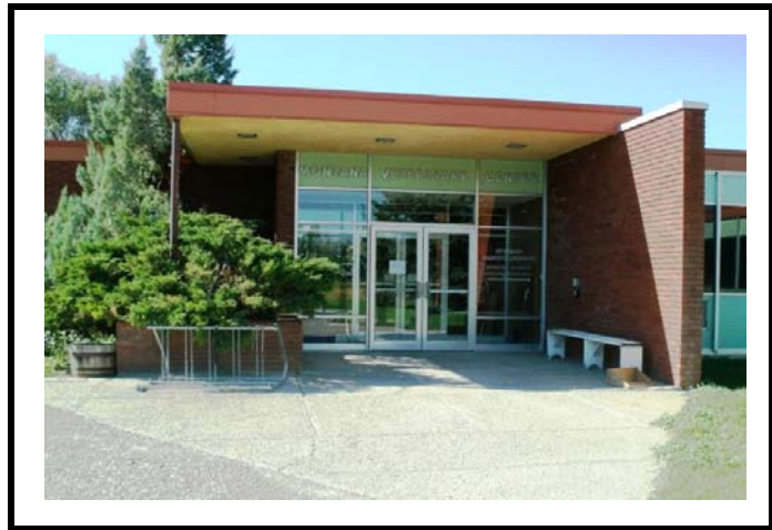
Montana Diagnostic Veterinary Laboratory, Bozeman

In past interims, the Department of Livestock (DOL) and the Committee had little interaction except for routine updates similar to those given by all the agencies for which the Committee has oversight responsibility. In the 2009-2010 interim the DOL's Diagnostic Veterinary Laboratory was at the center of the SJR 14 study of certain state laboratories. Discussions about coordinating or combining certain services at various laboratories related to the DOL, the Department of Fish, Wildlife, and Parks (FWP), and the Department of Agriculture resulted in increased communication among all three departments. The Department of Public Health and Human Services (DPHHS) initially was contacted about the SJR 14 study, but the DPHHS labs were in Helena, while all the other labs in the study were in Bozeman. The Committee voted at its May 2010 meeting to keep the focus on the labs in Bozeman, specifically excluding the Seed Laboratory at Montana State University and the Grain Lab in Great Falls. When the brucellosis issue generated more heat (see below), the Committee's contacts with DOL and FWP increased. For more details on the SJR 14 study, see the report "State Laboratories".