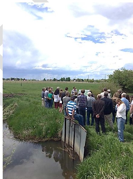
WPIC members discuss Gallatin Valley water issues during a 2018 field trip. (LEPO)