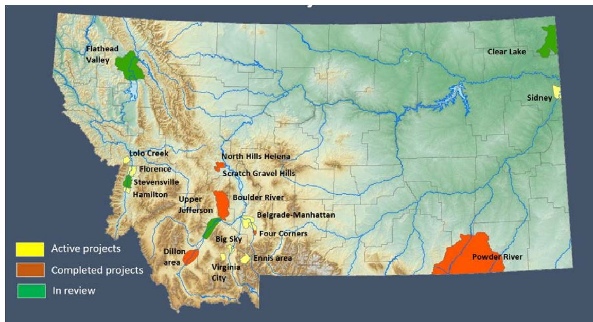
FIGURE 2: GROUND WATER INVESTIGATION PROJECT AREAS, 2018 30