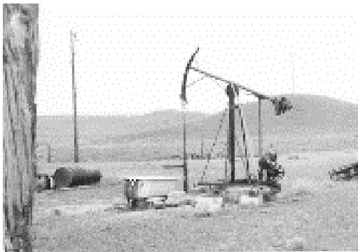
Small water well near Winnett, 1966.

The 1972 Constitution effectively modernized Montana’s water right process, again recognizing and confirming “all existing rights to the use of any water for any useful or beneficial purpose” and by providing for agency administration, control, and regulation of water rights. 10