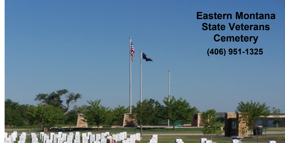
Eastern Montana State Veterans Cemetery