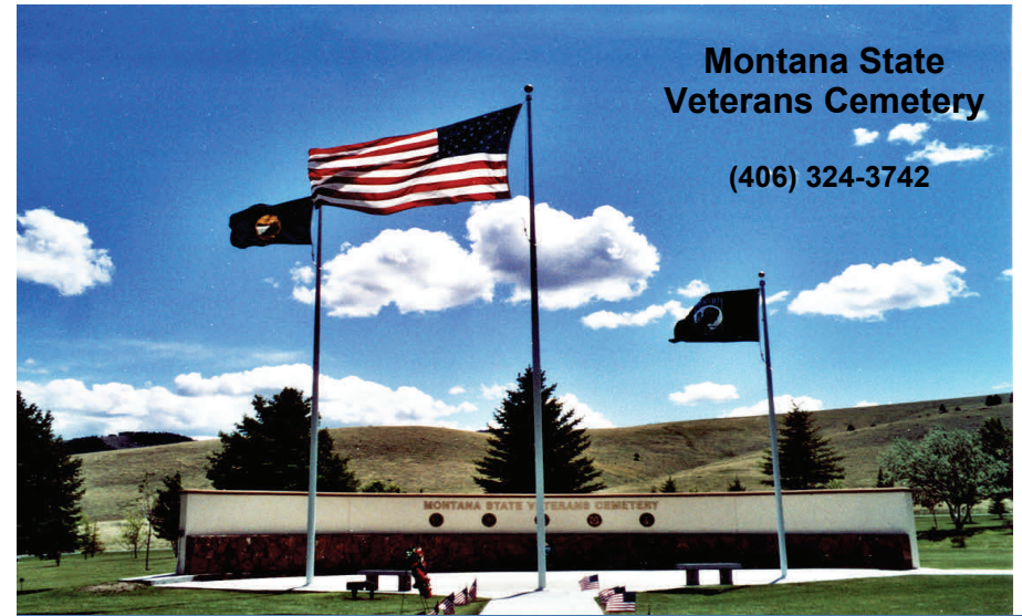
Montana State Veterans Cemetery

The headstone is furnished by the government as a benefit to the veteran/spouse, at no cost. However, the family will be responsible for the $115.00 setting fee cost. The Cemetery Sexton will complete the headstone application.