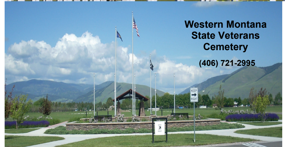
Western Montana State Veterans Cemetery