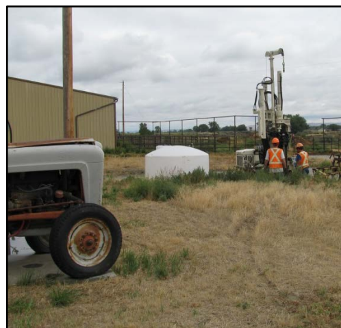
Sampling ranch for petroleum, Shepherd (Aug. 2016)