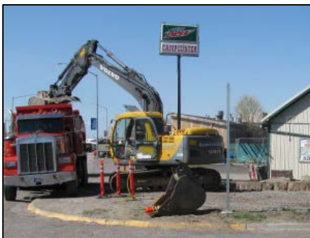
Excavating petroleum contaminated soil, Hardin (April 2016)