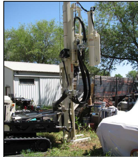
Sampling residential yard for petroleum, Billings (July, 2016)