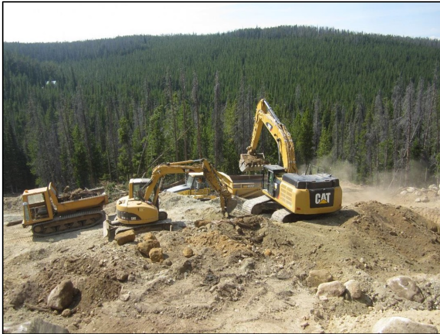
Removing mine tailings from abandoned mine in the headwaters of the Little Blackfoot River, near Elliston (August 2016)