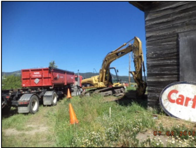
Excavating soil contaminated with wood-treating chemicals for offsite disposal, West Yellowstone (July 2016)