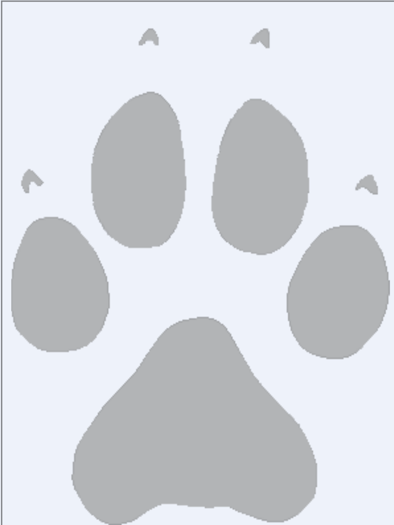
Actual size wolf track (typical adult front foot)