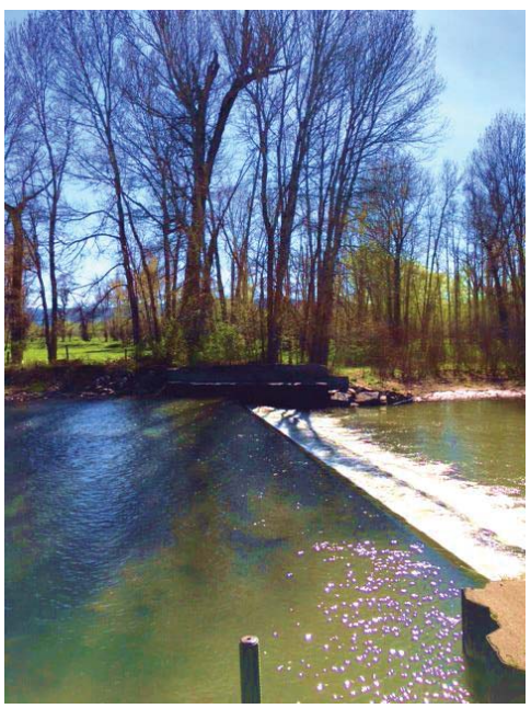
West Gallatin River at Farmers Canal diversion

Other issues raised during this study include the timelines for DNRC action on new water right permits or changes, the "time gap" that results when the DNRC calculates historic use for a new water right or a change application, and the venue for appeals to DNRC permit and change decisions.