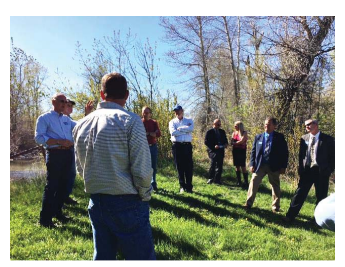
WPIC field trip in Gallatin Valley, May 2016

The DNRC has proposed a pilot project as it distributes Tongue River water under a U.S. Supreme Court order. This pilot project will require legislation.