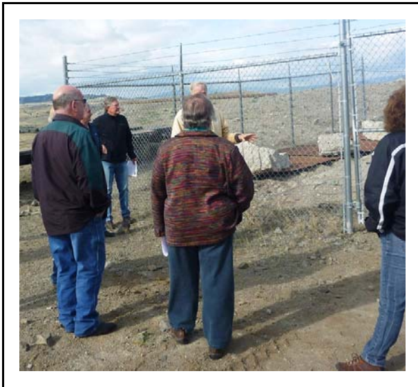
◀ ETIC members tour Butte energy facilities.

A culmination of questions about previously contemplated legislation led to a decision by the ETIC to take another look at Montana's one-call effort and to encourage stakeholders to continue to work toward consensus.