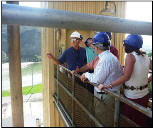
◀ ETIC members tour Colstrip.

Because federal rulemaking likely will not be complete before the September 15, 2012, conclusion of the 2011-2012 interim, the ETIC is not advancing draft legislation to modify Montana's one-call law.