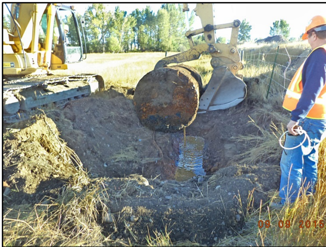
Underground storage tank removal; Deer Lodge (Sept. 2015)