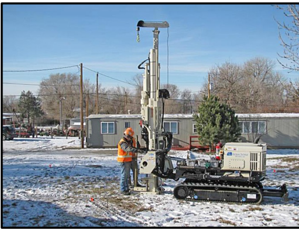
Using GeoProbe to measure contamination near residential area; Billings (Dec, 2015). This site is now resolved.