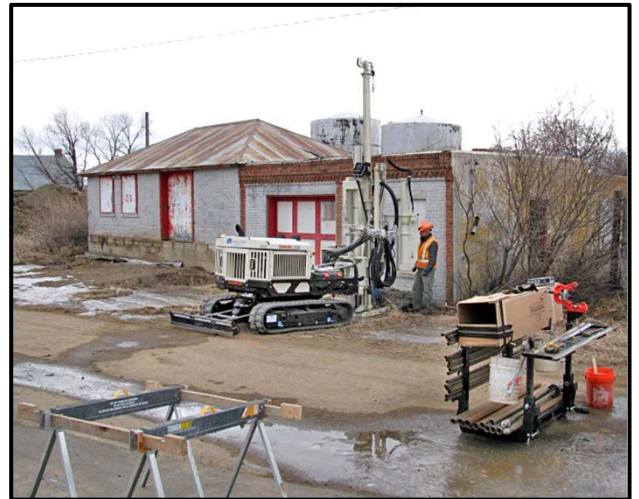
GeoProbe installing borings at former service station, Plevna. (Feb. 2016)