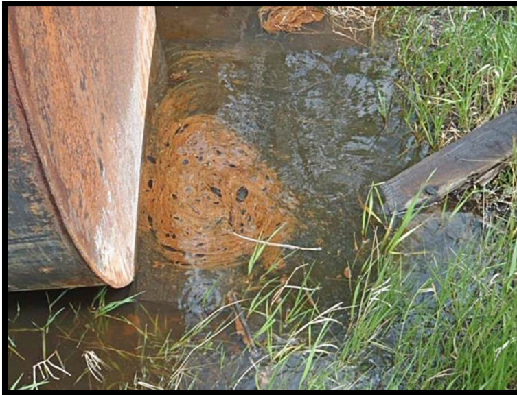
Petroleum product floating on groundwater; Harlowton. (Cleanup scheduled for summer 2016)