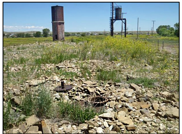
Top of buried rail car containing free product. Waste oil tank in background; Harlowton. (cleanup scheduled for summer 2016)