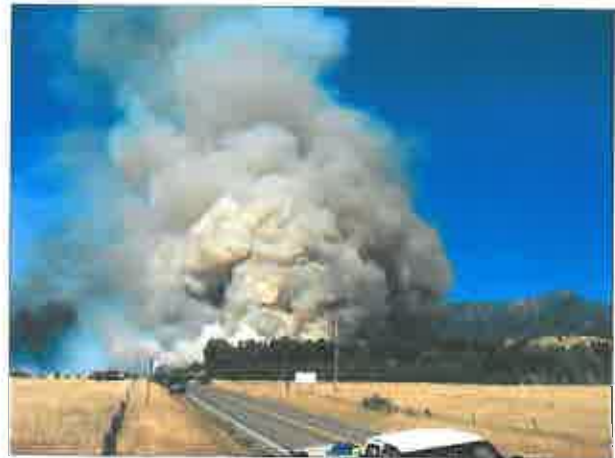
Pine Creek Fire south of Livingston